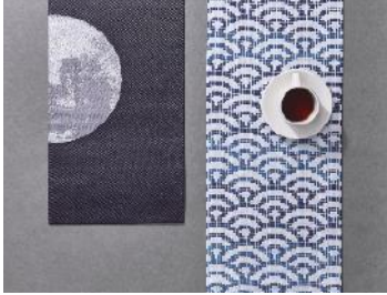
WATABUN CO., LTD. NISHIJIN-ORI (WEAVING) 'Seigaiha'(blue ocean wave pattern) & 'Moon' centerpieces

The following images and DENSAN logo are available for media use. To request images, please contact the public relations office shown below.