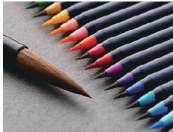
AKASHIYA CO., LTD. NARA-FUDE (WRITING BRUSH) 'Sai' watercolor brush