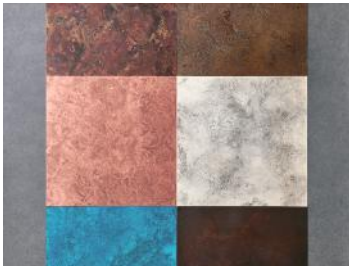
MOMENTUM FACTORY ORII TAKAOKA-DOKI (METALWORK) 'Orii marble' copper or brass tiles