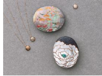
URUSHI ART HARIYA YAMANAKA-SHIKKI (LACQUERWARE) 'Mother of Pearl with Maki-e' accessories series