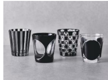
KIMOTO GLASSWARE CO., LTD. EDO-KIRIKO (CUT GLASS) 'MOON' & 'KUROCO' cut glass