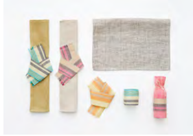
SHIGA-KEN HEMP-RAMIE TEXTILE INDUSTRIAL ASSOCIATION 「OMI-JOFU」 Placemat (Ramie and Linen)」 OMI-JOFU

To request images, please contact the public relations office shown below.