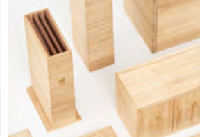
MORI WOODCRAFT 「'KEI」 wooden kitchen ware」 KYO-SASHIMONO