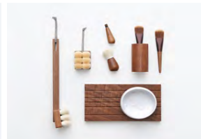
MIZUHO BRUSH CO.,LTD. 「'SUVÉ」 brushing skin care」 KUMANO-FUDE