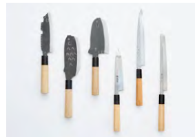
IKEDA TANRENJO SAKAI-UCHIHAMONO