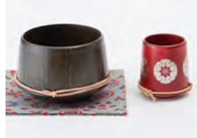
B PRIZE CORPORATION 「NODATE-MUG」 & 「KOBUKUSA」 AIZU-NURI