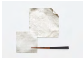
SHIMATANI SYOURYU-KOUBOU INC. 「SUZUGAMI」 TAKAOKA-DOKI