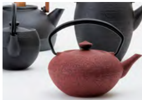
CHUSHIN KOBO CO.,LTD. 「'CHUSHIN KOBO」 iron kettles」 YAMAGATA-IMONO