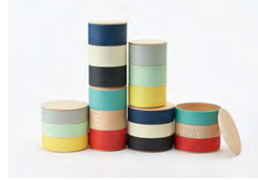
HATASHIKITEN CO.,LTD. 「col. series 'BORDER」 wooden container」 YAMANAKA-SHIKKI